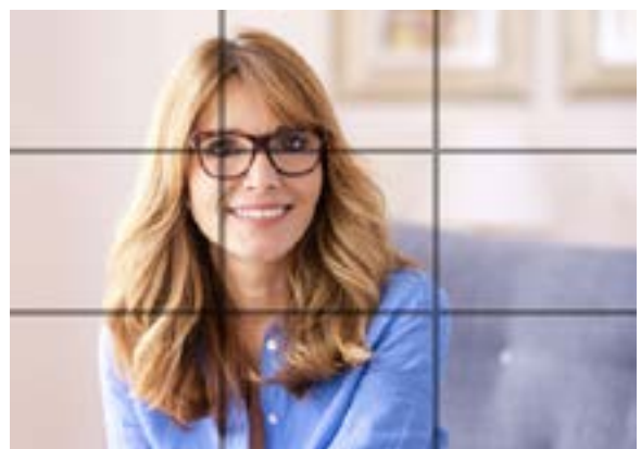
Place yourself in 2/3 of the screen.

First, make sure your camera, if on a mobile device is in a horizontal position. If it's vertical the video for your viewers will show up smaller on screen and it will be harder to see you. Then, try to sit far enough away from your devices camera so that your head and shoulders are in view. Sitting too close to the screen can be distracting for your viewers because some camera angles can exaggerate your facial features and distort your appearance. Lastly, try to sit slightly off-center in your camera's view. You'll notice if you watch professionals on film they will often be placed in the 3rd part of the screen and not centered. There are numerous sources online as to why this is important on camera. Without going into all the details let's just say that it helps make your view more aesthetically pleasing to your viewer.