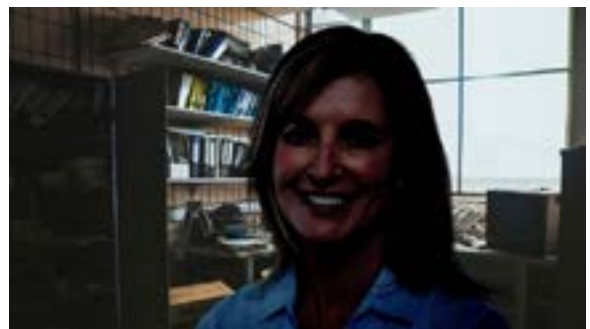
Poor visibility when a window is behind you.

The best lighting is natural light, such as from a window. But make sure the light, whether coming from a window or another source, is in FRONT OF YOU. If you have an open window placed behind you on camera it can create a silhouette and make it hard for viewers to see you. You can test this when you set up a meeting ahead of time with your administrator.