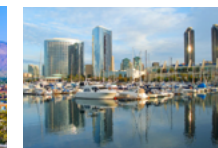
San Diego, CA