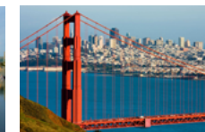
San Francisco, CA