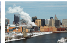
St. Paul, MN