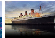
Long Beach, CA