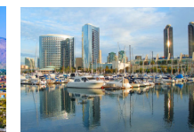
San Diego, CA