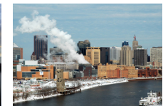
St. Paul, MN