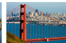
San Francisco, CA